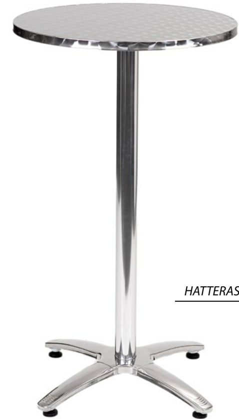
HATTERAS 2424AR bar height