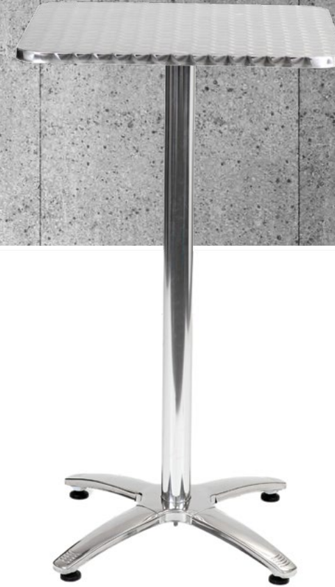
HATTERAS 2424AS bar height