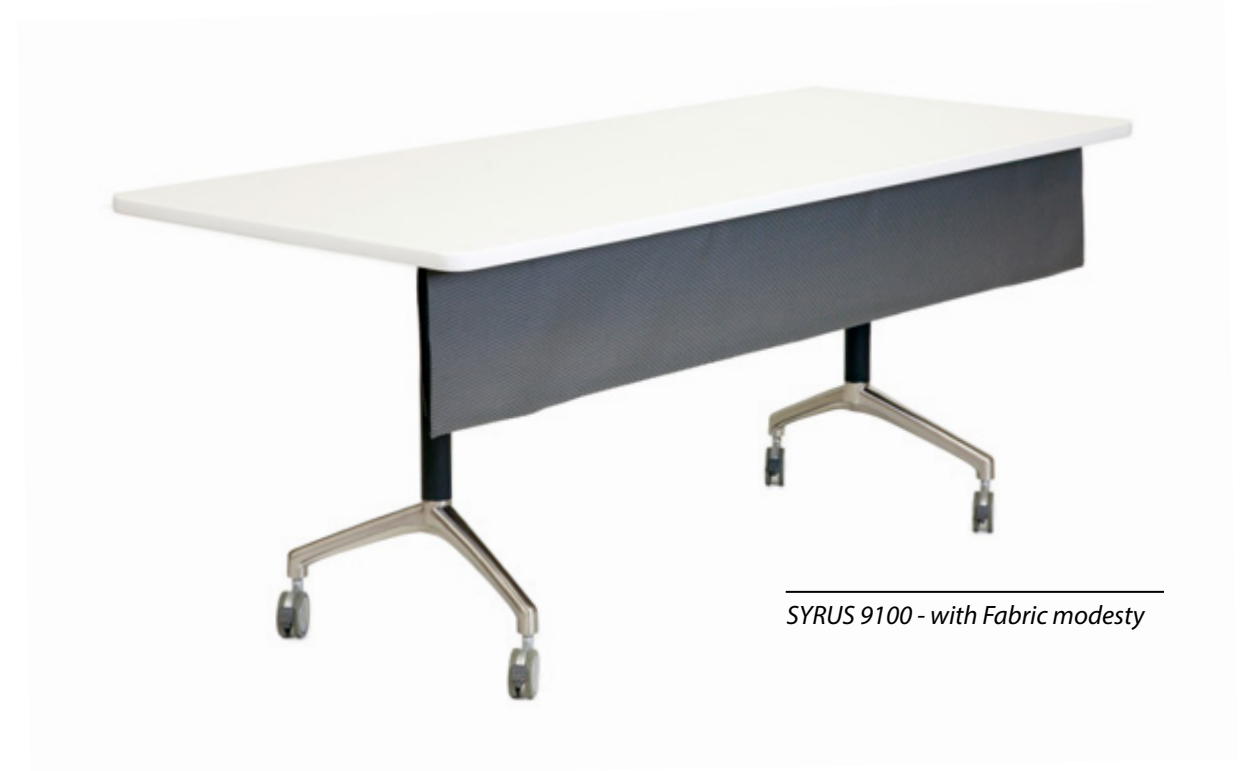
SYRUS 9100 - with Fabric modesty