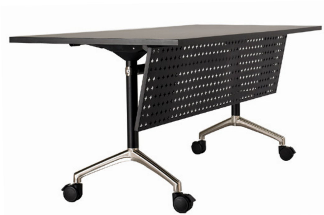
SYRUS 9100 - with Perforated modesty